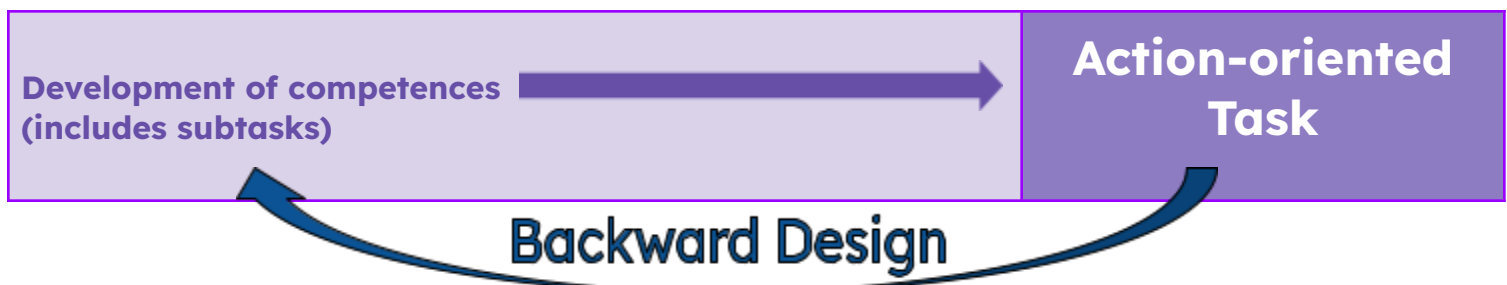
Figure 1: Components of an Action-oriented Scenario

“teaching language as a system of disconnected and isolated components gives learners some knowledge of the language, but does not allow them to use the language effectively. In contrast, communicative and action-oriented approaches to teaching French put meaningful and authentic communication at the centre of all learning activities” (The Ontario Curriculum, FSL, p. 9).